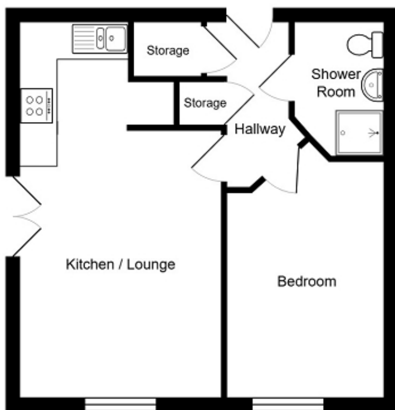
GROUND FLOOR APARTMENT

Every effort has been taken in preparing these details as carefully as possible, however, intending purchasers should be aware that their accuracy is not guaranteed, all measurements are approximate and this does not form any part of any contract. Daniel Matthew Estate Agents has not tested any apparatus, fixtures, fittings, central heating systems or services mentioned in these particulars and intending purchasers are advised to satisfy themselves as to their working order or condition.