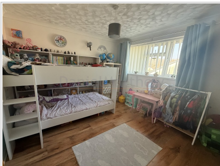
Bedroom Two (10' 2" x 9' 7") or (3.09m x 2.92m)

UPVC double glazed window to front aspect, textured ceiling, plain walls with one feature papered wall, fitted carpet, built in wardrobes, radiator.