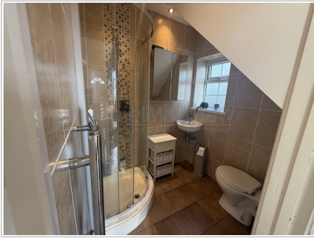
Downstairs Shower Room (5' 10" x 5' 2") or (1.78m x 1.57m)

UPVC double glazed obscured window to side aspect, plain ceiling with spot lights, tiled walls, tiled flooring, three piece suite comprising low level WC, corner floating wash hand basin, corner shower cubicle with over head mains, radiator.