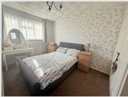
Bedroom One (13' 7" x 9' 8") or (4.13m x 2.94m)

UPVC double glazed window to side aspect, textured ceiling with coving and loft access, plain walls, fitted carpet, doors leading into;-