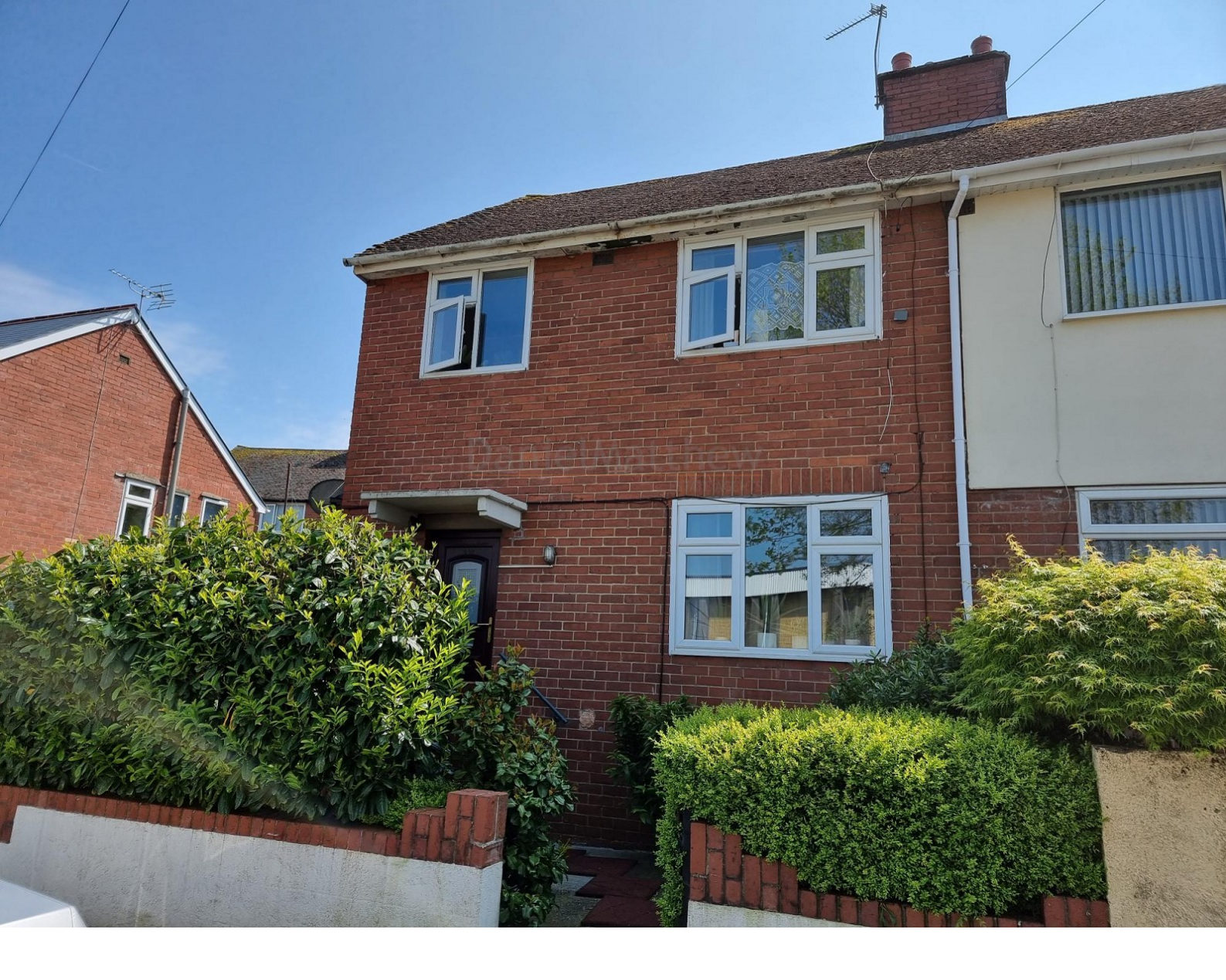
Gladstone Road, Barry, The Vale Of Glamorgan. CF63 1QG £240,000