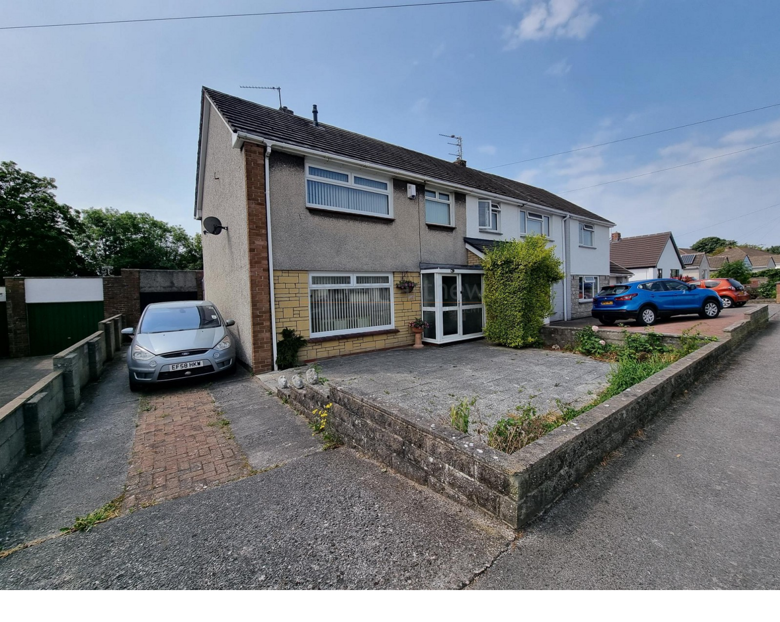
Fairfield Rise, Llantwit Major, The Vale Of Glamorgan. CF61 2XG £250,000